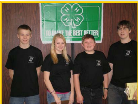
First Place A Team from Indiana County