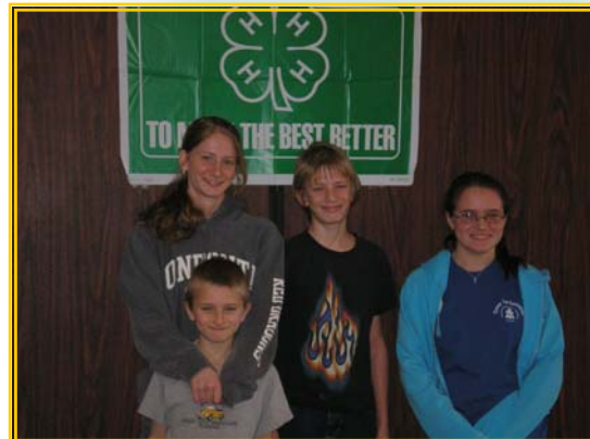
First Place B Team from Bradford County