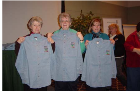
Recipients are recognized for their 20+ years of volunteer service at this year's State Leaders Forum.

In spite of a slippery start, the 4-H State Leaders Forum, Volunteers Build 4-H Forever, was a great success on February 1-2. Volunteers will be returning to counties with tools to run more effective club meetings, develop public speaking skills in 4-H members, manage their time, and focus on new project areas. Thanks to all who sent such a dynamic group of volunteers! The state level forum will be held again in 2010. In the meantime, you may want to recruit some of these volunteers to teach workshops at your regional forums in 2009.