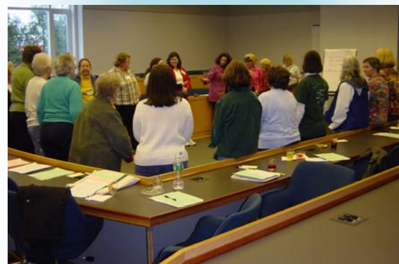
Attendees participate in workshop during 2008 State Leaders Forum.